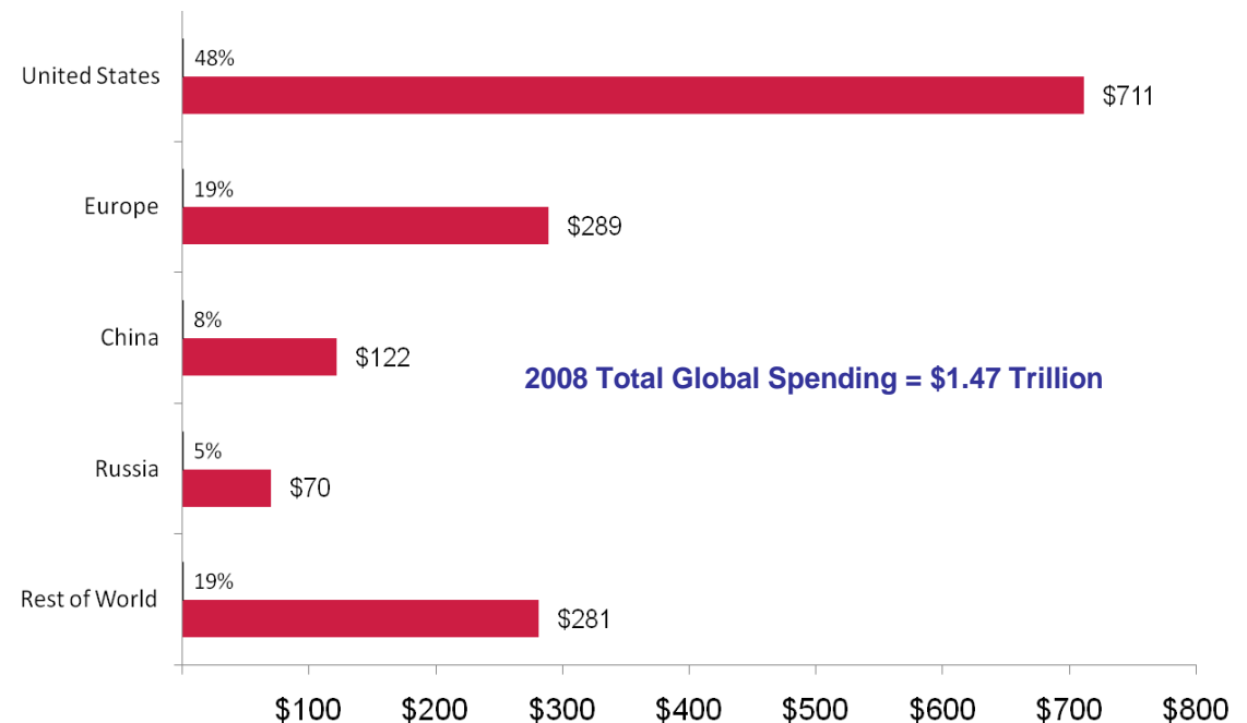
Military spending in 2008, in billions of US dollars, with % of world total